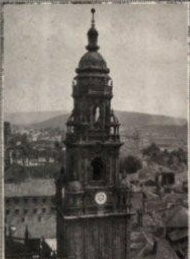
CLOCK TOWER OF SANTIAGO CATHEDRAL