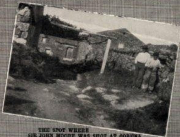
THE SPOT WHERE SIR JOHN MOORE WAS SHOT AT OORUNA