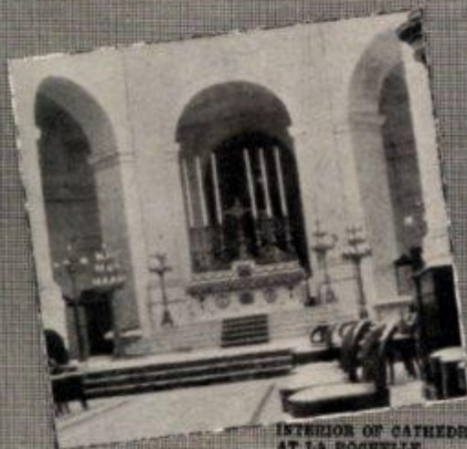
INTRIION OF CATHEDRAL AT LA ROCHELLE