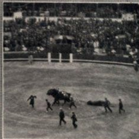
THE CAUSE OF ALL THE TROUBLE