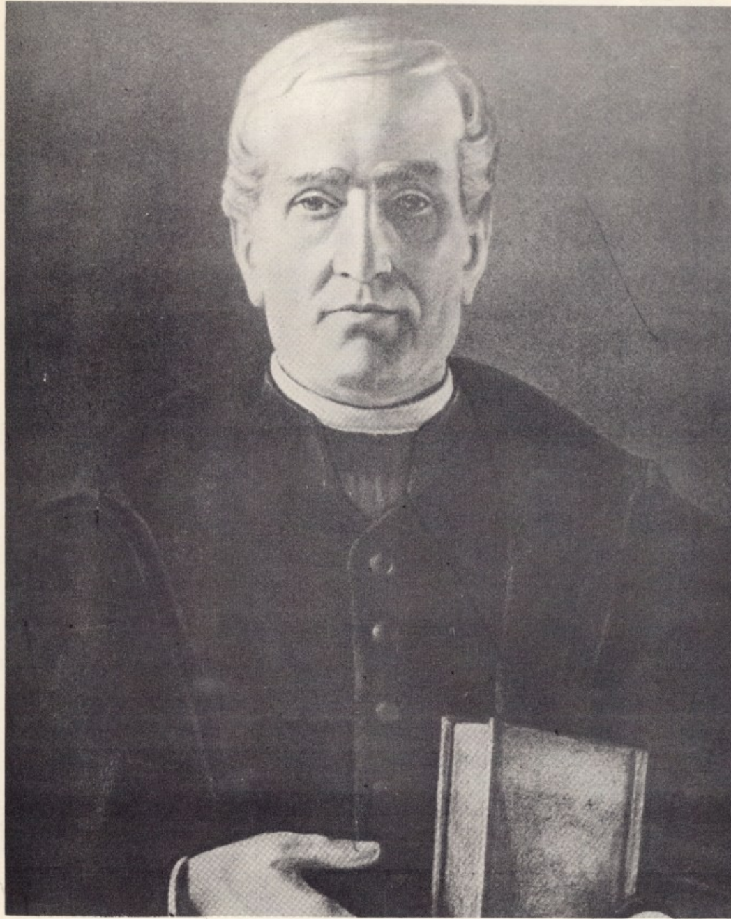
EDMUND IGNATIUS RICE

Founder and First Superior-General of The Christian Brothers Born 1762 — Died 1844