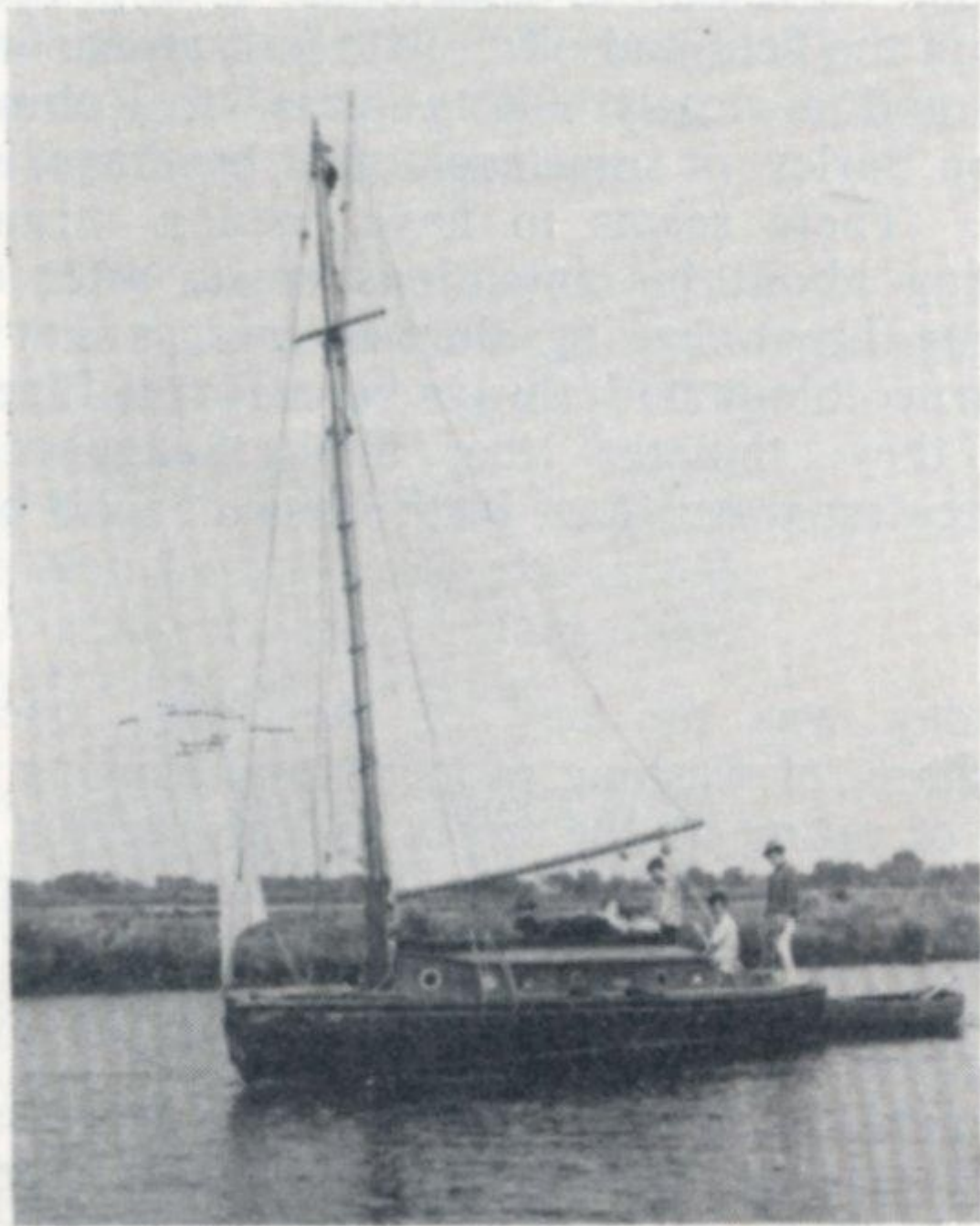
"Pandora IV" near Ranworth Dam