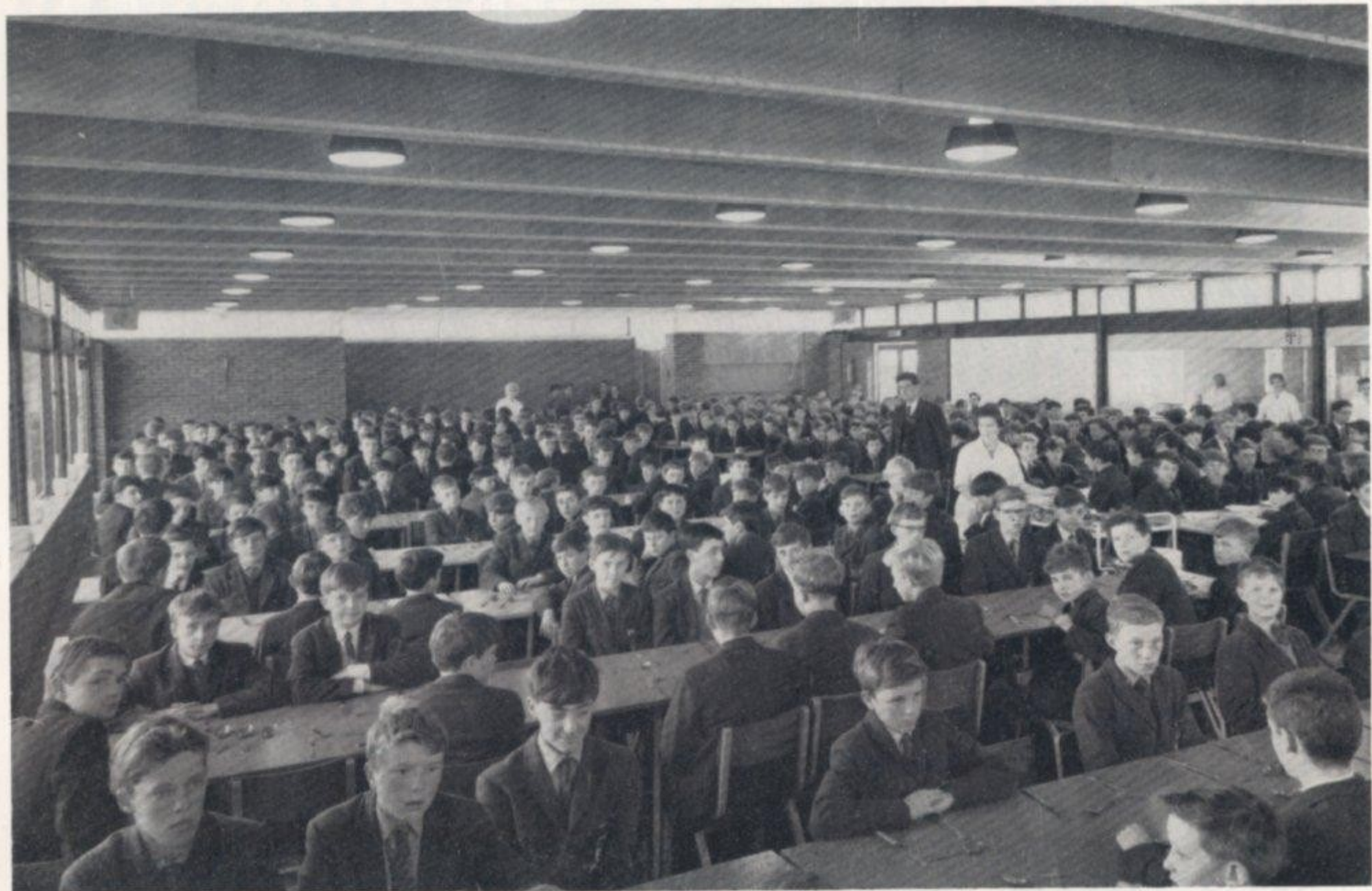
View of New Dining Hall