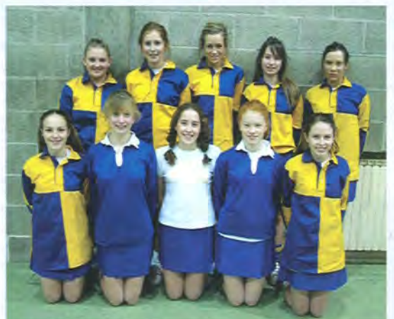
The Under 14 Hockey team won the Liverpool League

The U14s had an unbeaten run of 14 games at the beginning of the season whilst the U12s and U13s have both won about three quarte of games so far. The U14s and U15s teams are currently fundraising for a tour to New Zealand in Summer 2005.