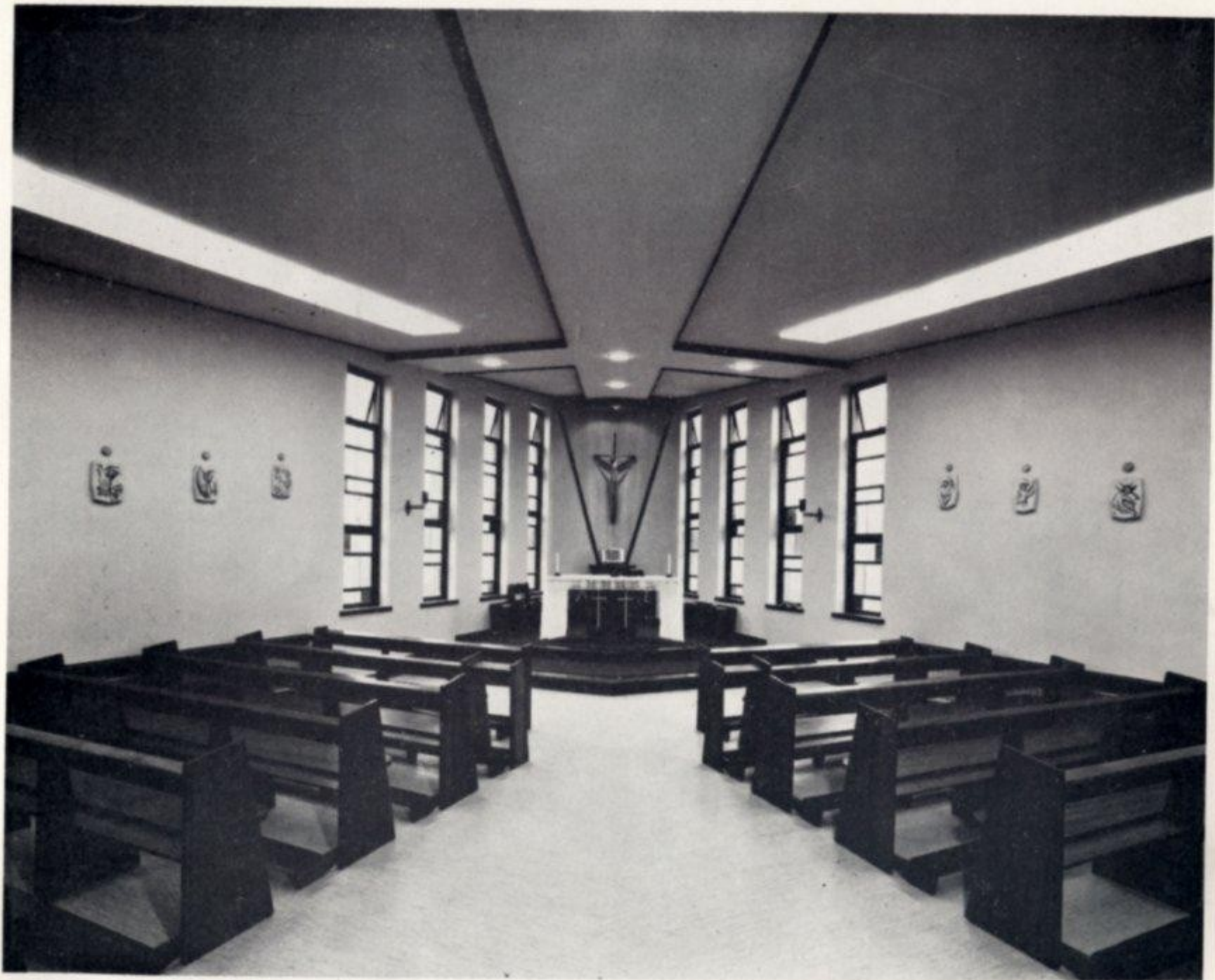
ST. EDWARD'S COLLEGE CHAPEL — INTERIOR