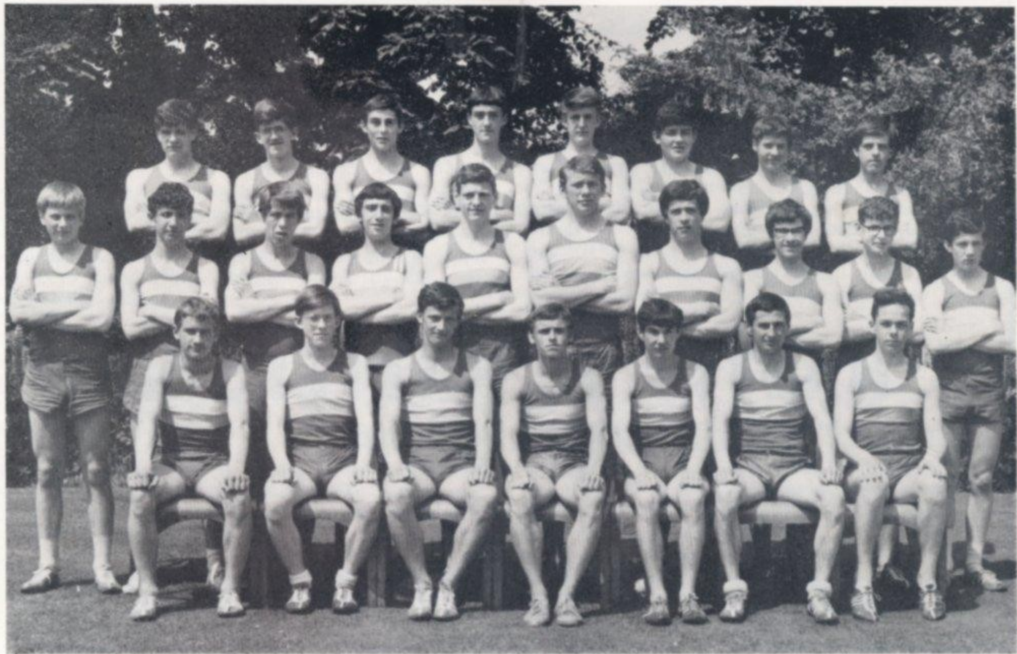
SENIOR AND INTERMEDIATE ATHLETICS TEAM