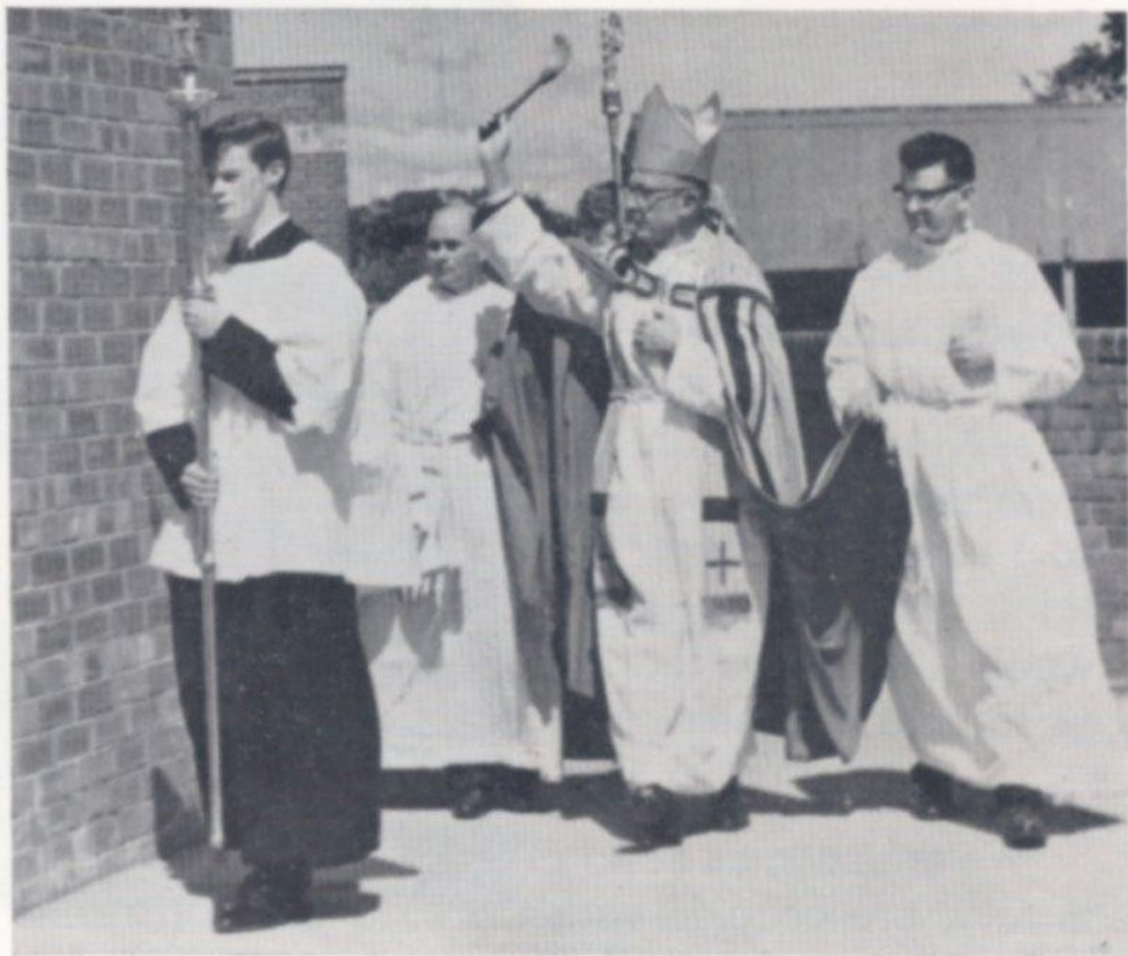
His Grace the Archbishop blesses the exterior of College Chapel.