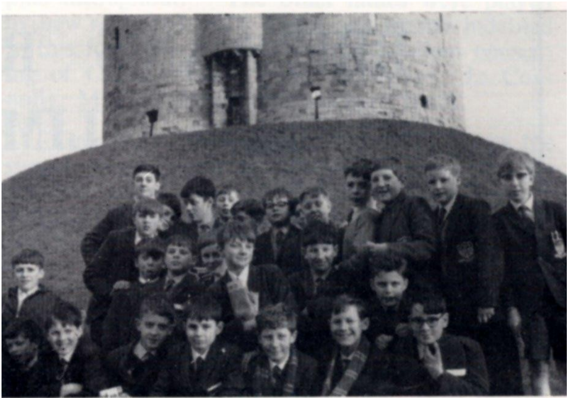
At the foot of Clifford's Tower