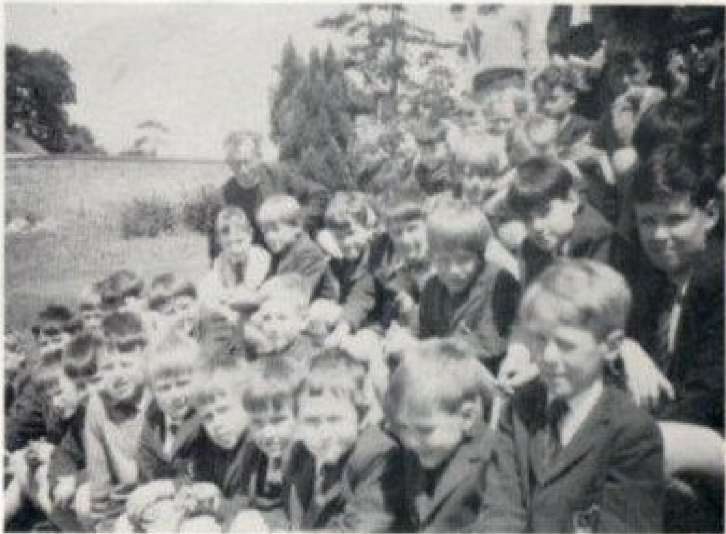
Enjoying ourselves at Capesthorpe Hall