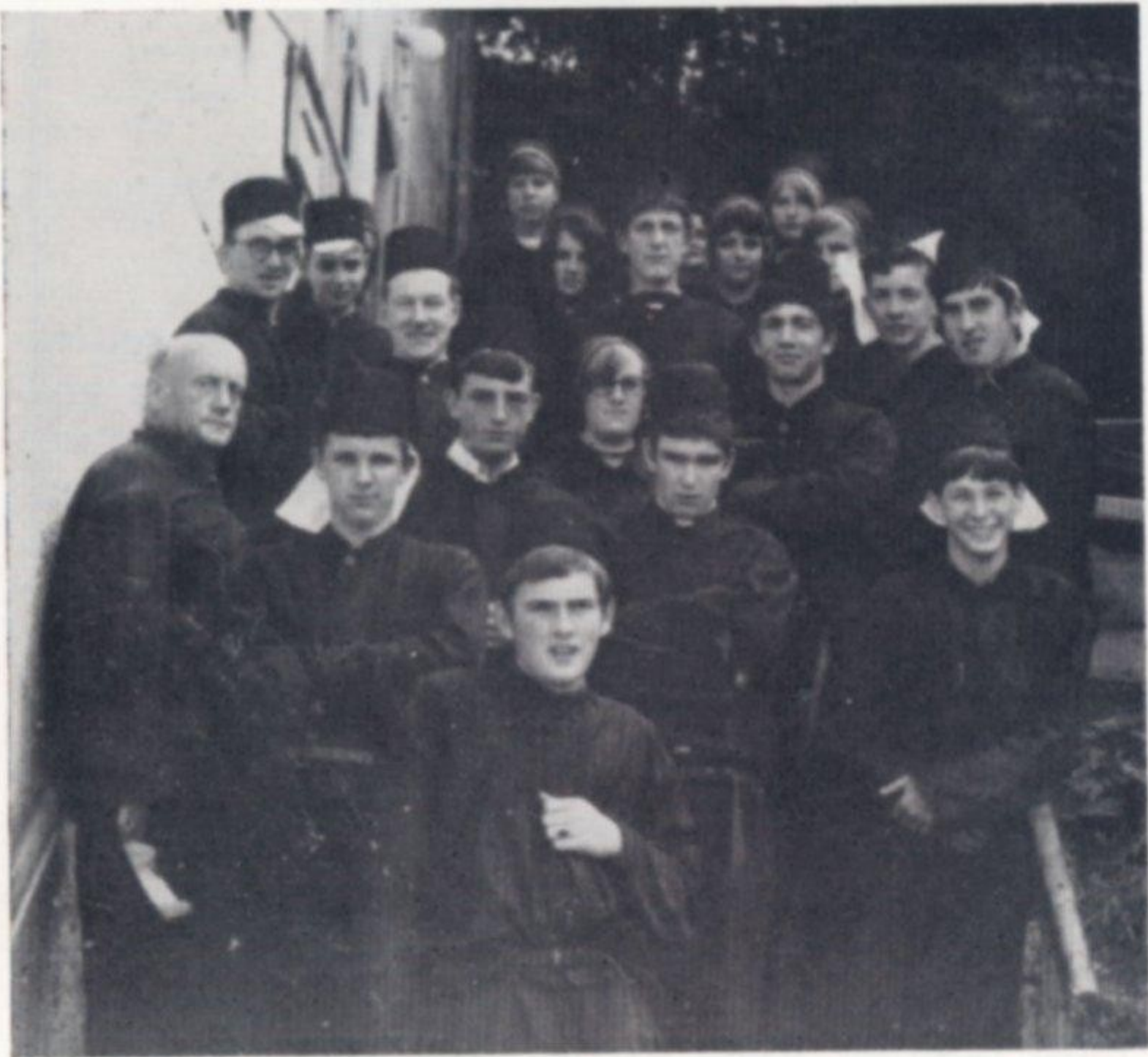
Going down to the salt mine!