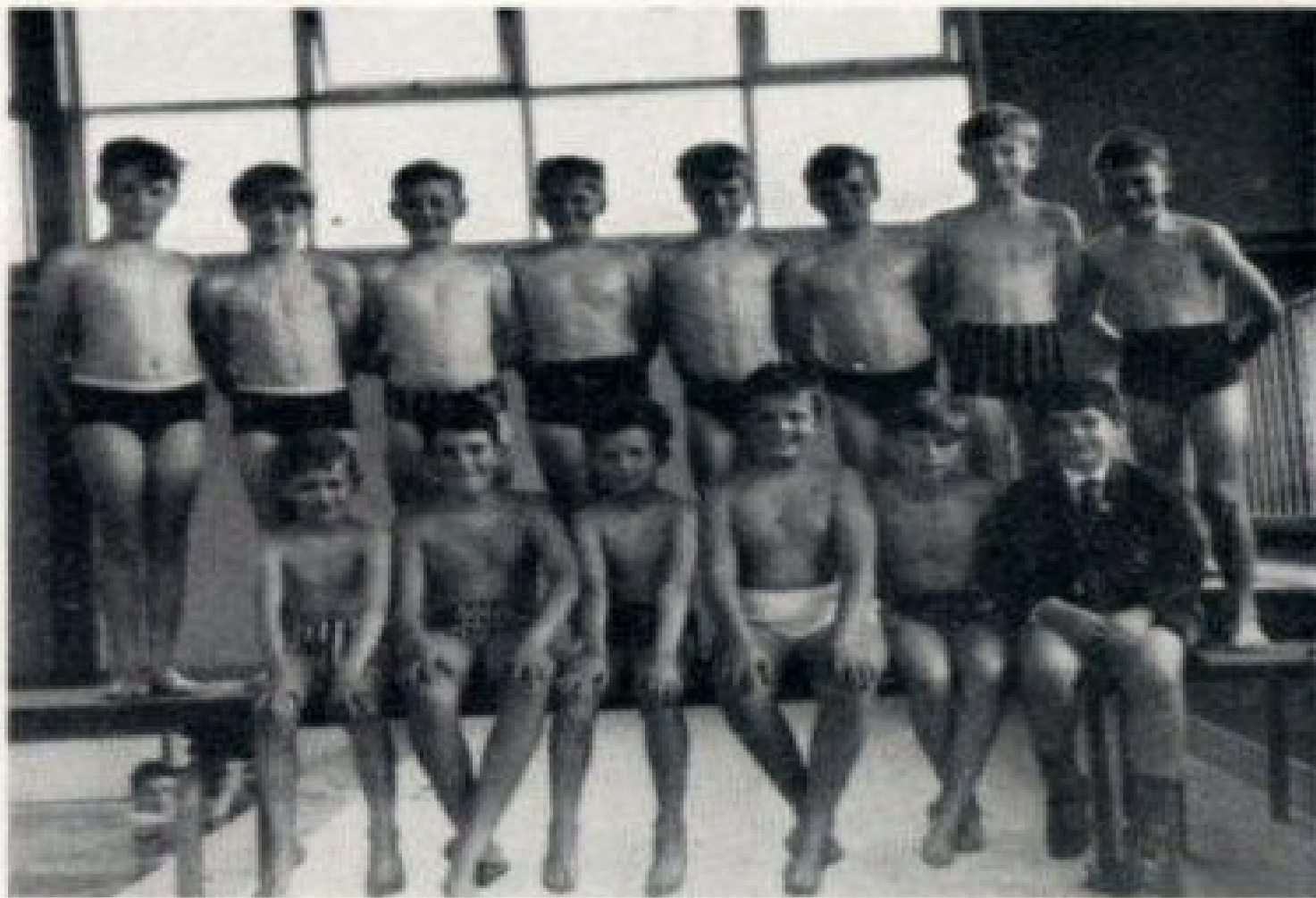
Runnymede award winners for swimming