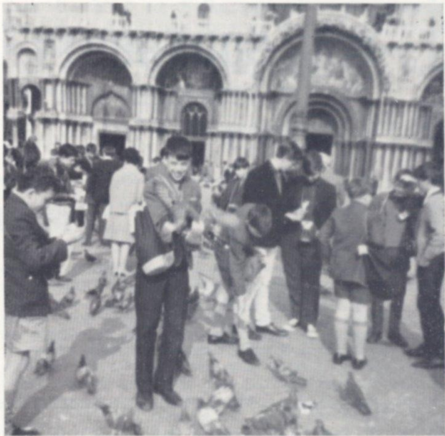
St. Mark's Square, Venice.