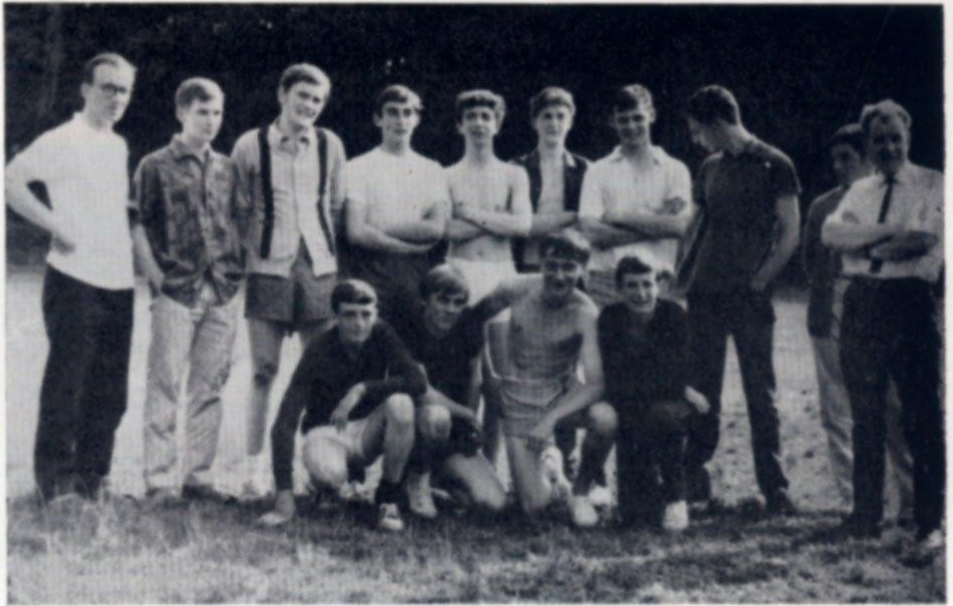
Hotel Olga — Garden at Zell.