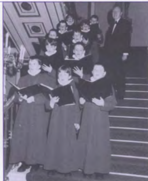
The Headmaster with the Choristers who sang before the Lord Mayor's Charity Ball at the Town Hall, May 1999