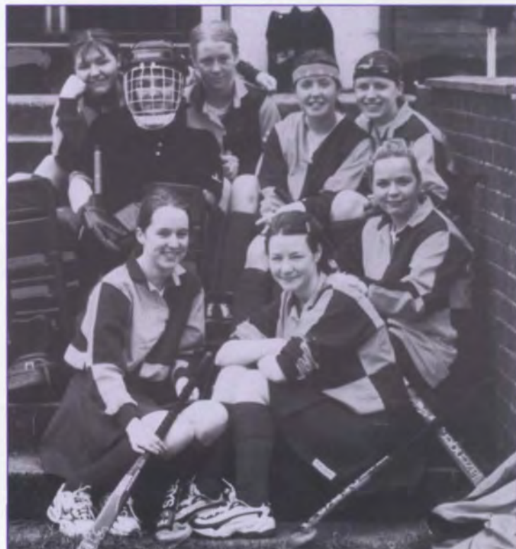
1st XI 1998-99