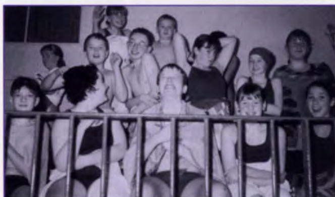
Yr8 pupils swim for MS