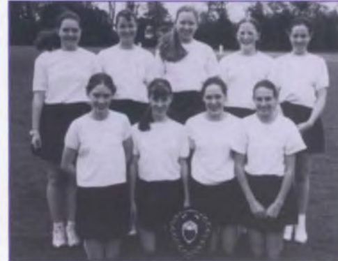
U14s Netball Team — City Champions