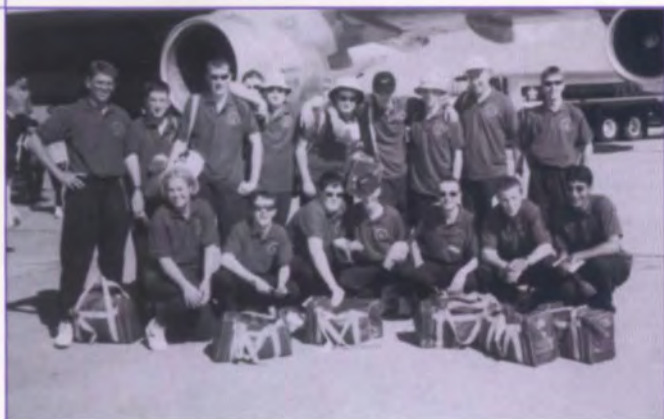
The Barbados team before boarding the plane.