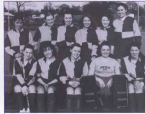
1st XI Hockey team 1998-99