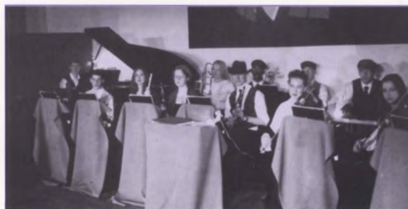
Musicians in rehearsal for Oliver