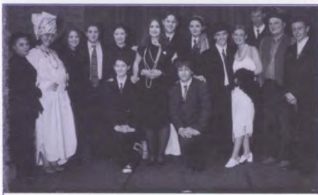
The cast of the Merchant of Venice