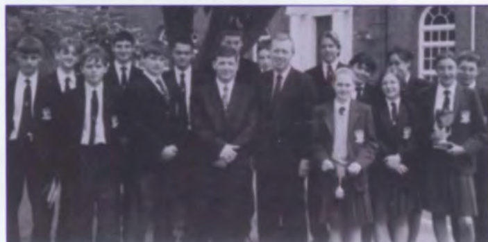
Junior Colours Presentation 1998