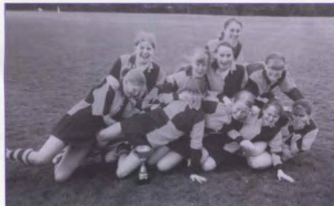
U15s Hockey Team finally collapses

St. Edward's Under12 A-Team has won both the Liverpool Under 12 League and the Liverpool Under 12 Championship. In the League, the A Team won with maximum points in all eleven matches. In the Championship, in difficult conditions, the A Team won four and drew two of their matches. The B Team also put in a good performance, not conceding a single goal.