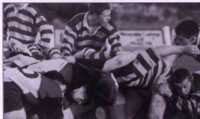
Away v Caldey Grange Grammar School