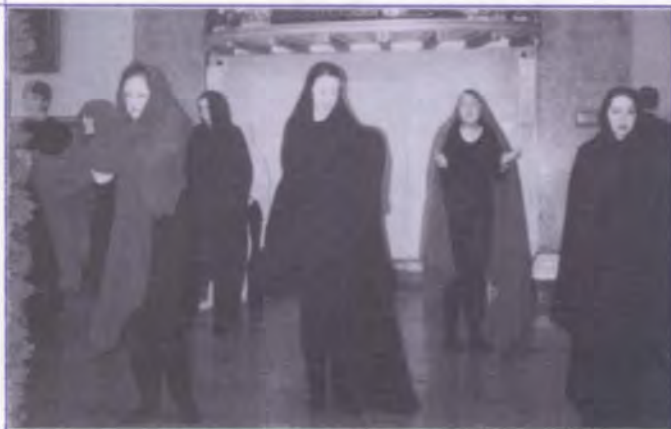
Year 12 pupils perform at the Liverpool Arts Festival