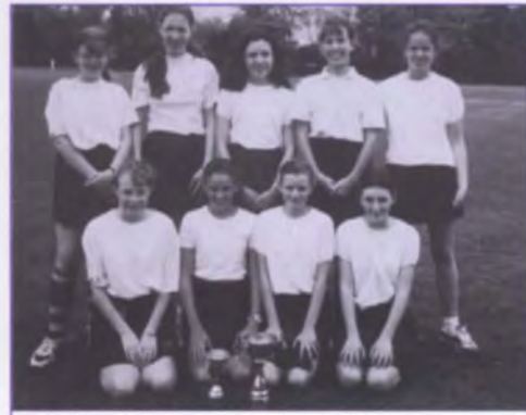
U12 Hockey Team City Champions, League Champions