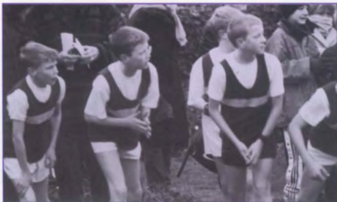
The start of the Cross Country at Caldey Grange Grammar School