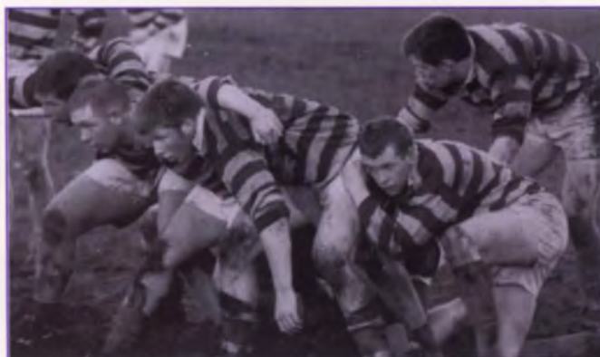
Away v Cowley High School 10 - 0 St. Edwards