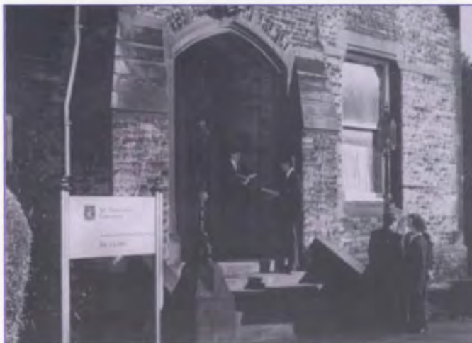
The front entrance for the new Upper School Centre 2000

Little more needs to be said about the high regard in which the College is held on Merseyside!