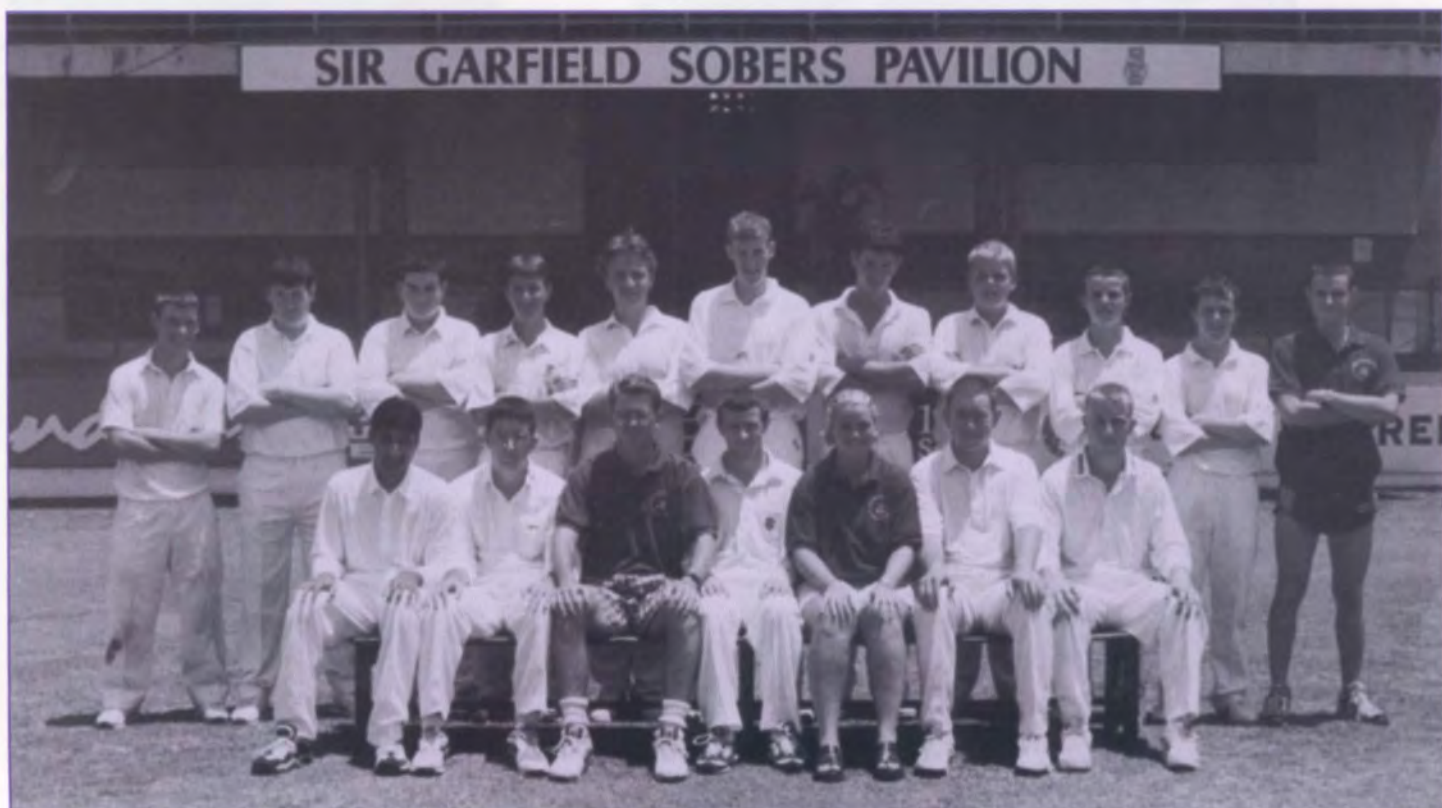
The Barbados Cricket Tour July 1998

Plans are already afoot for the senior hockey and netball teams to join the cricketers on a millennium tour of Barbados.