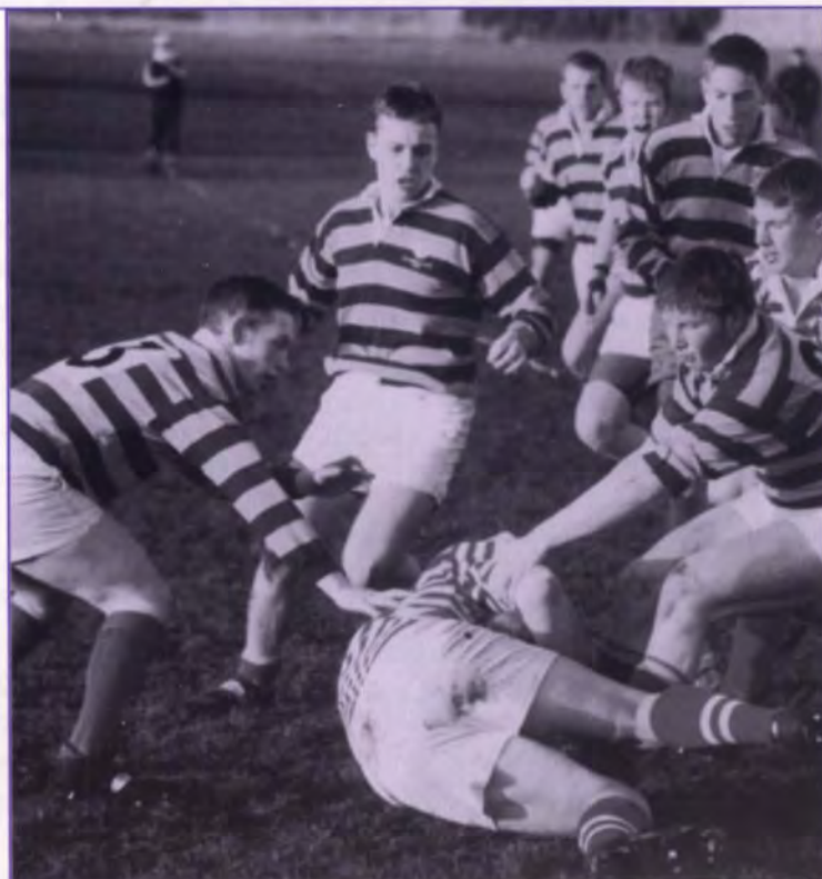
Away v Caldey Grange Grammar School 10 - 0 St. Edwards