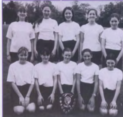
U12s Netball Team — City Champions