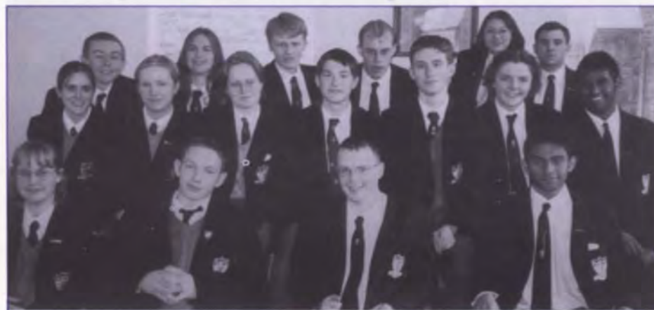
Year 13 fine musicians who move on to higher education in July 1999. They leave quite a gap in the college orchestra.