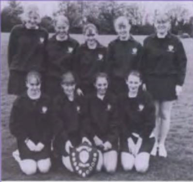
U15s Netball Team — City Champions