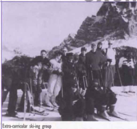
Extra-curricular ski-ing group