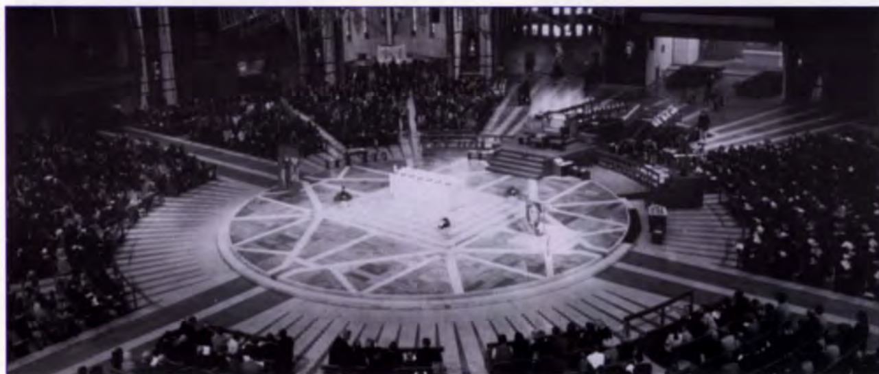
St. Edward's Day Mass