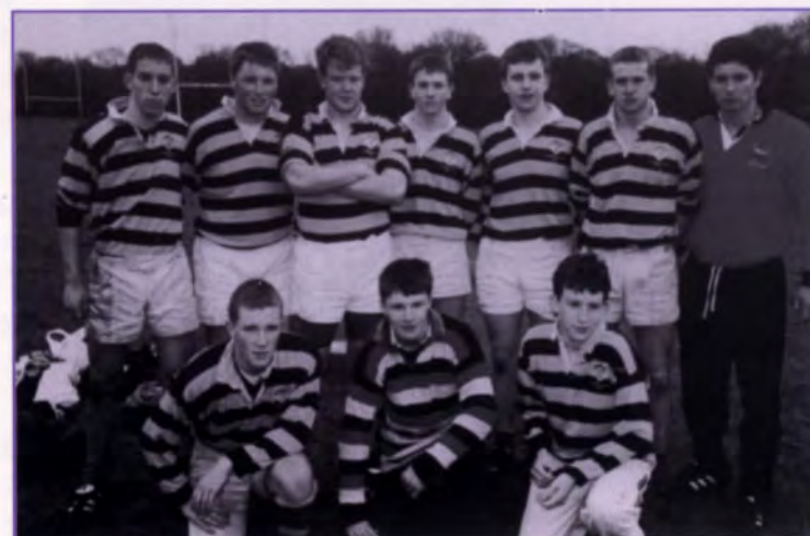
Senior 7s squad at Rosslyn Park